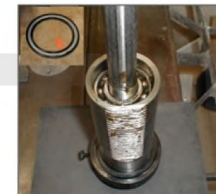
Press fit items