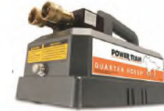
3. Battery Power Pump