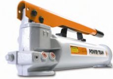
1. Hand Pump