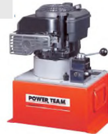
5. Gasoline / Petrol Power Pump