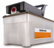
4. Air Power Pump