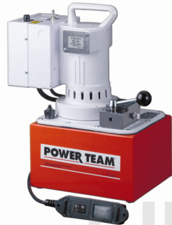
Universal Motor (Single Phase)

PE55 Series – Equipped with a 1-1/8 hp, single-phase universal motor, have a 90-95 dBA noise level. Offer the best weight to performance ratio of any Power Team electric/hydraulic pump. CSA rated for intermittent duty.