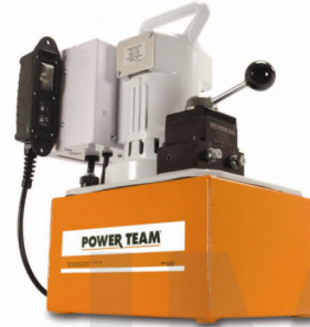
2. Electric Power Pump